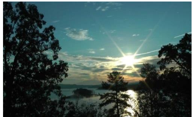
Sunrise on Broken Bow Lake in southeast Oklahoma